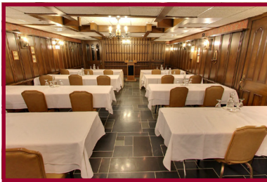
Keeping Room - Classroom