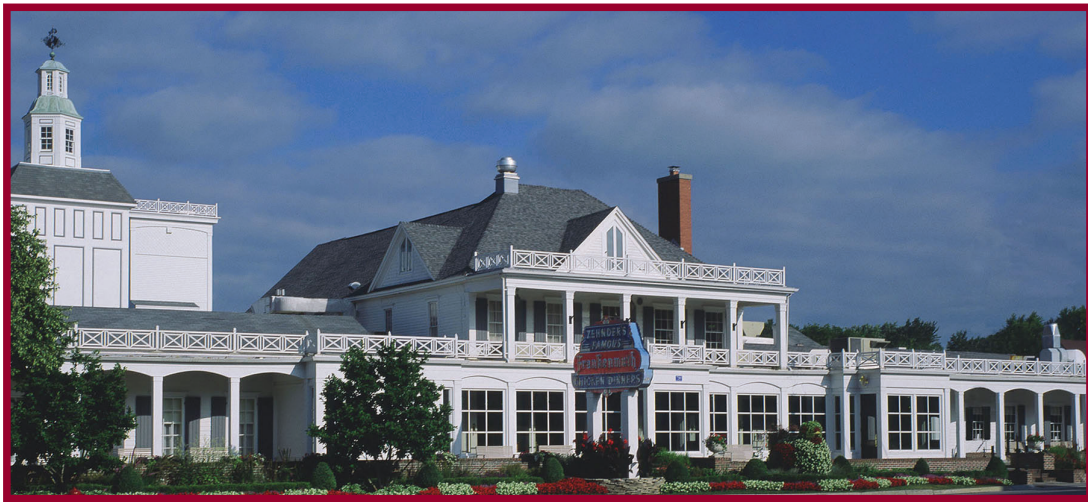
Zehnder's Restaurant and Meeting Facilities