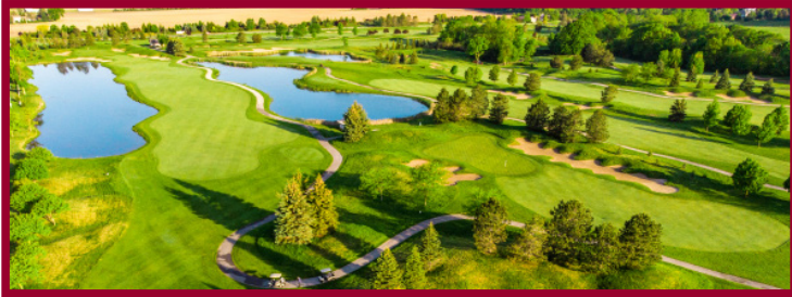
The Fortress 18 Hole Championship Golf Course