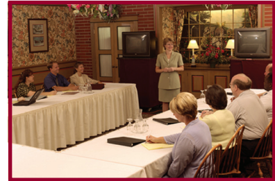
Original Room - U-Shape