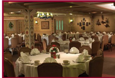
Town Hall Dining Room