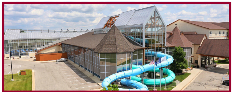
Zehnder's Splash Village Hotel & Waterpark