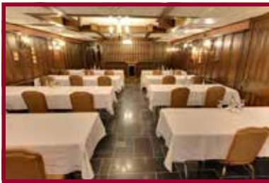
Keeping Room - Classroom