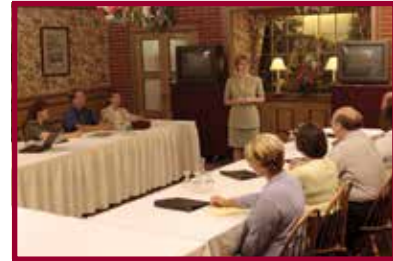
Original Room - U-Shape