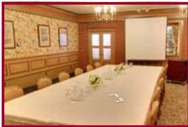
Original Room - Conference