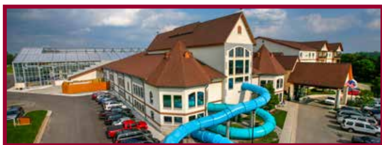
Zehnder's Splash Village Hotel & Waterpark