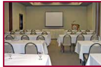
Splash Hospitality Room - Classroom