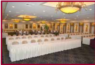
Main Dining Room - Classroom