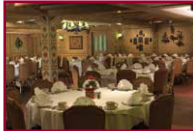
Town Hall Dining Room