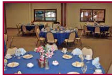
Splash Hospitality Room