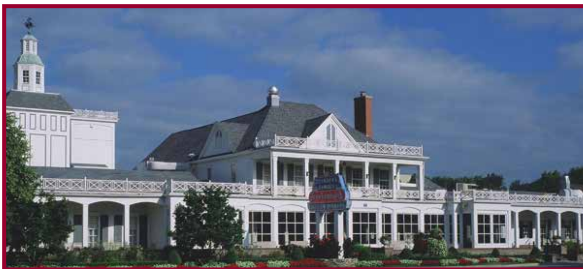
Zehnder's Restaurant and Meeting Facilities