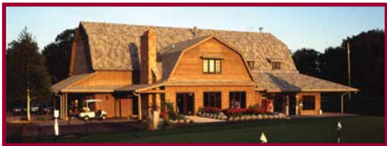
The Fortress 18 Hole Championship Golf Course