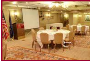
Town Hall Dining Room - Rounds