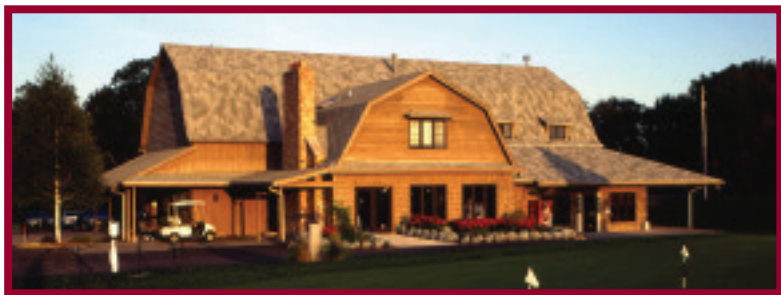
The Fortress 18 Hole Championship Golf Course