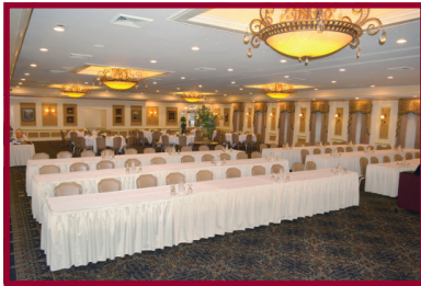
Main Dining Room - Classroom