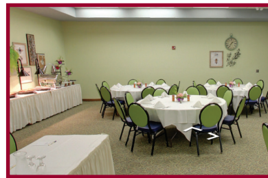
Splash Hospitality Room