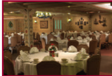
Town Hall Dining Room