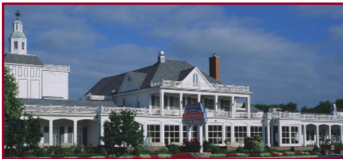
Zehnder's Restaurant and Meeting Facilities