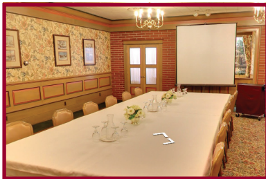
Original Room - Conference