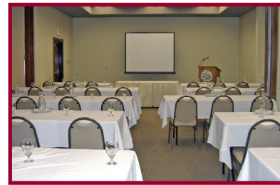
Splash Hospitality Room - Classroom