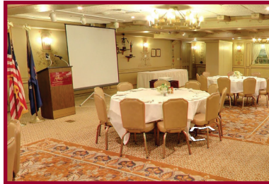
Town Hall Dining Room - Rounds