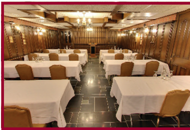
Keeping Room - Classroom