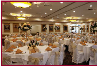
Main Dining Room