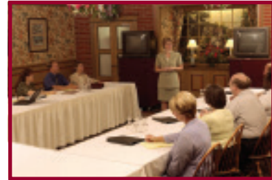
Original Room - U-Shape